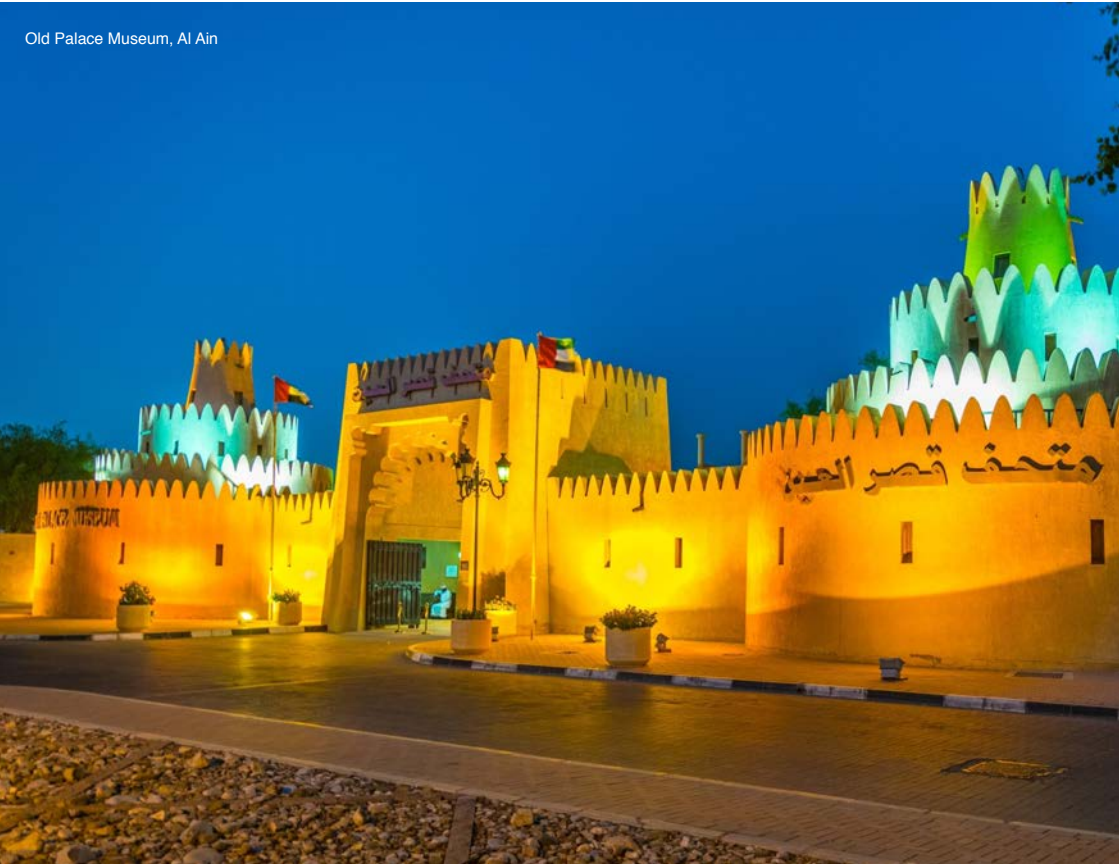
Old Palace Museum, Al Ain

Al-Ain is developing as a tourist destination as the dry desert air makes it a welcome retreat from the coastal humidity of the larger cities. Its attractions include the Al Ain National Museum, the Al Ain Palace Museum, several restored forts and the Hili Archaeological Park site, dating back to the Bronze Age. Jebel Hafeet dominates the surrounding area. It is popular to visit to the mineral springs at Green Mubazzarah at the base of the mountain, and to drive to the mountaintop at sunset.