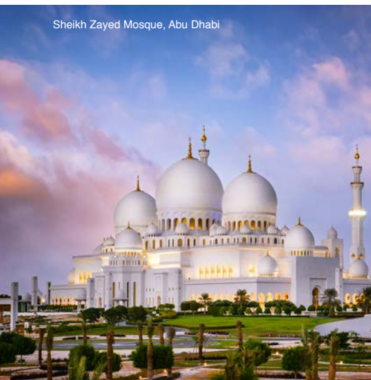
Sheikh Zayed Mosque, Abu Dhabi

Accordingly, some restaurants and coffee shops are either concealed from public view or closed during the daytime. Business and school hours also change during this period and normally, offices open for shorter hours than usual.